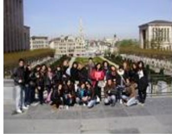
EXCHANGE WITH FRANCE