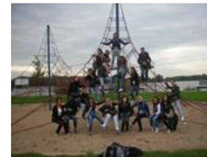
EXCHANGE WITH THE NETHERLANDS

Our school takes part in Cultural Exchanges with other schools from Denmark, France, Germany and the Netherlands. Exchanges usually last from seven to ten days. Students are hosted by families and are fully immersed in the local language. Exchanges are a great way to learn about new cultures and see new places and cities in Europe.