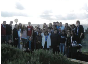
EXCHANGE WITH DENMARK