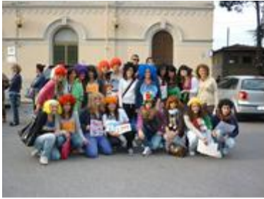
EXCHANGE WITH GERMANY